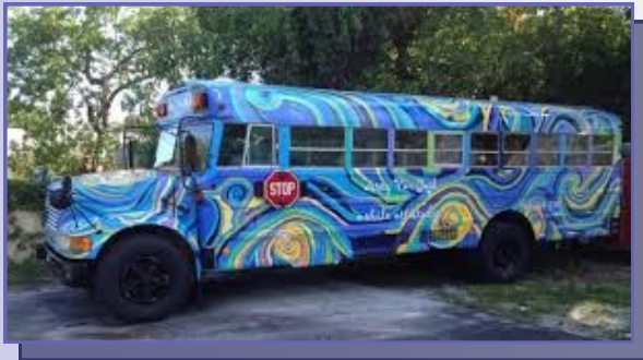
Arty Van Gogh—a huge hit with the children in 2016!

The Greater Tamarac Chamber of Commerce Arts & Crafts Committee 7525 N Pine Island Road #103 Tamarac, Florida 33321